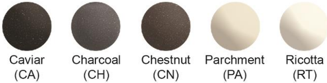
Caviar (CA) Charcoal (CH) Chestnut (CN) Parchment (PA) Ricotta (RT)

32-3/8" x 21-3/8" (822mm x 543mm) with 11/16" (17mm) corner radius